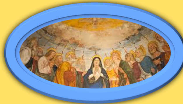
Our Lady with the Apostles and Disciples at Pentecost